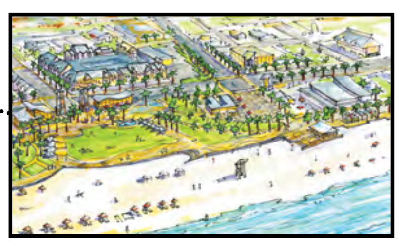
GULF SHORES GULF BEACH DISTRICT