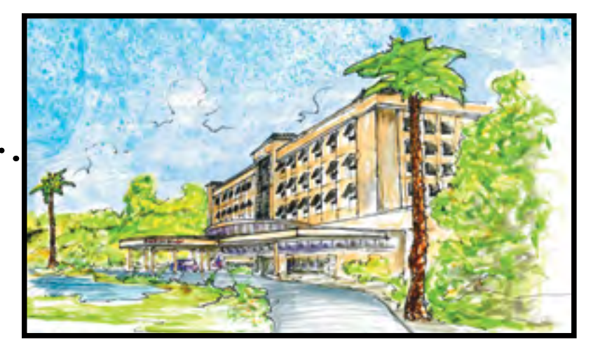
COASTAL ALABAMA MEDICAL COMPLEX