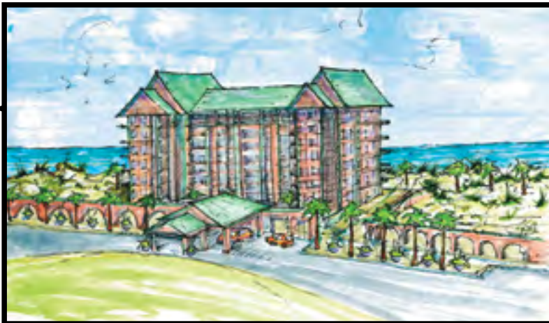
GULF STATE PARK RESTORATION