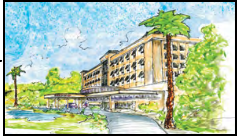
COASTAL ALABAMA MEDICAL COMPLEX