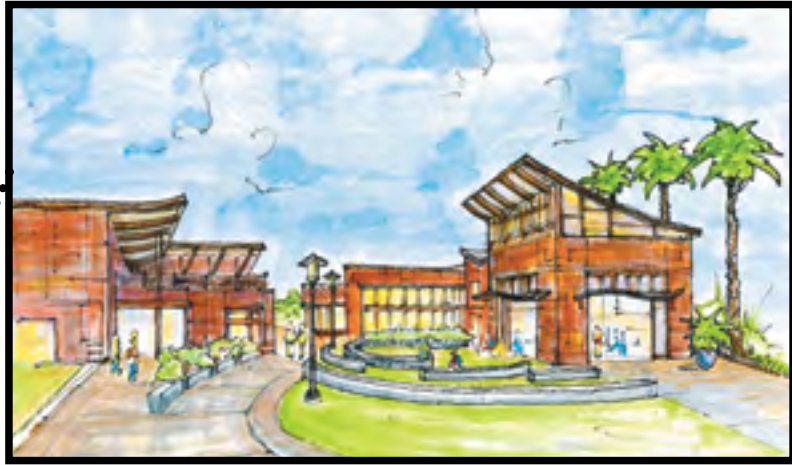
COASTAL ALABAMA CENTER FOR EDUCATION EXCELLENCE