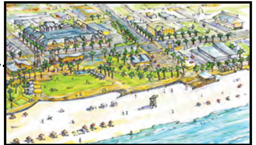
GULF SHORES GULF BEACH DISTRICT